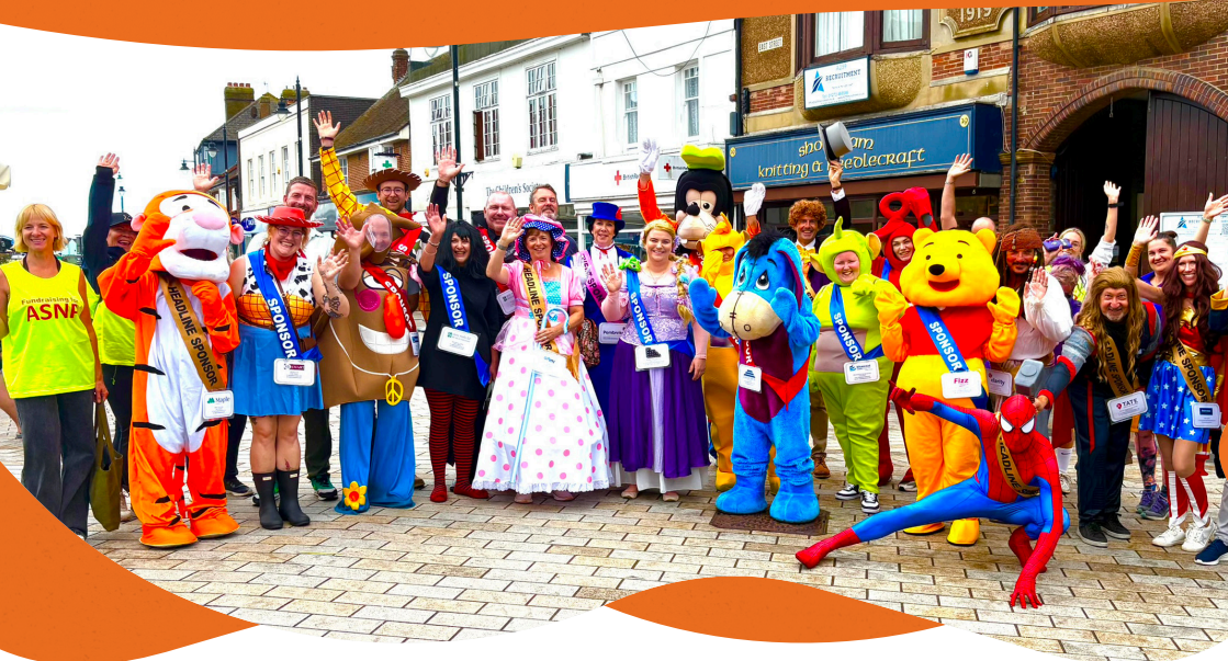
Photo: Shoreham Star Trail, ASNP.